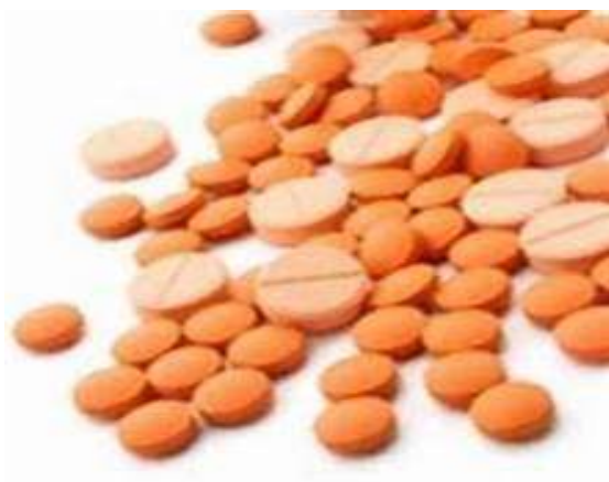
Fig no.3 Compressed Tablet