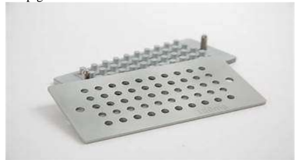
Fig No.1 Molds Tablet