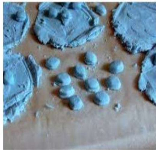
Fig no.2 Molded Tablet